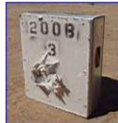
Sample 3 Pretest Impact Side Sample 3 Pretest Rear Side Sample 3 Posttest Impact Side Sample 3 Posttest Rear Side